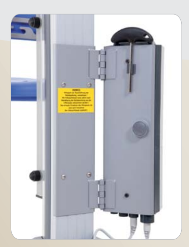
The battery can be removed at the side for narrow doors.

2 Hand-held remote control with disturbance and service display and permanent display of the battery charge status.