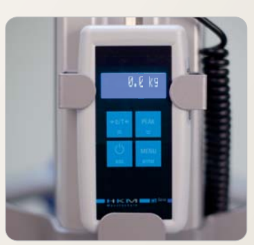
Optional: Digital patient scale, not calibrated.