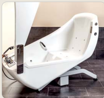
8 Ergonomical seat and back shapes with hygienic opening for better access to the intimate zone.