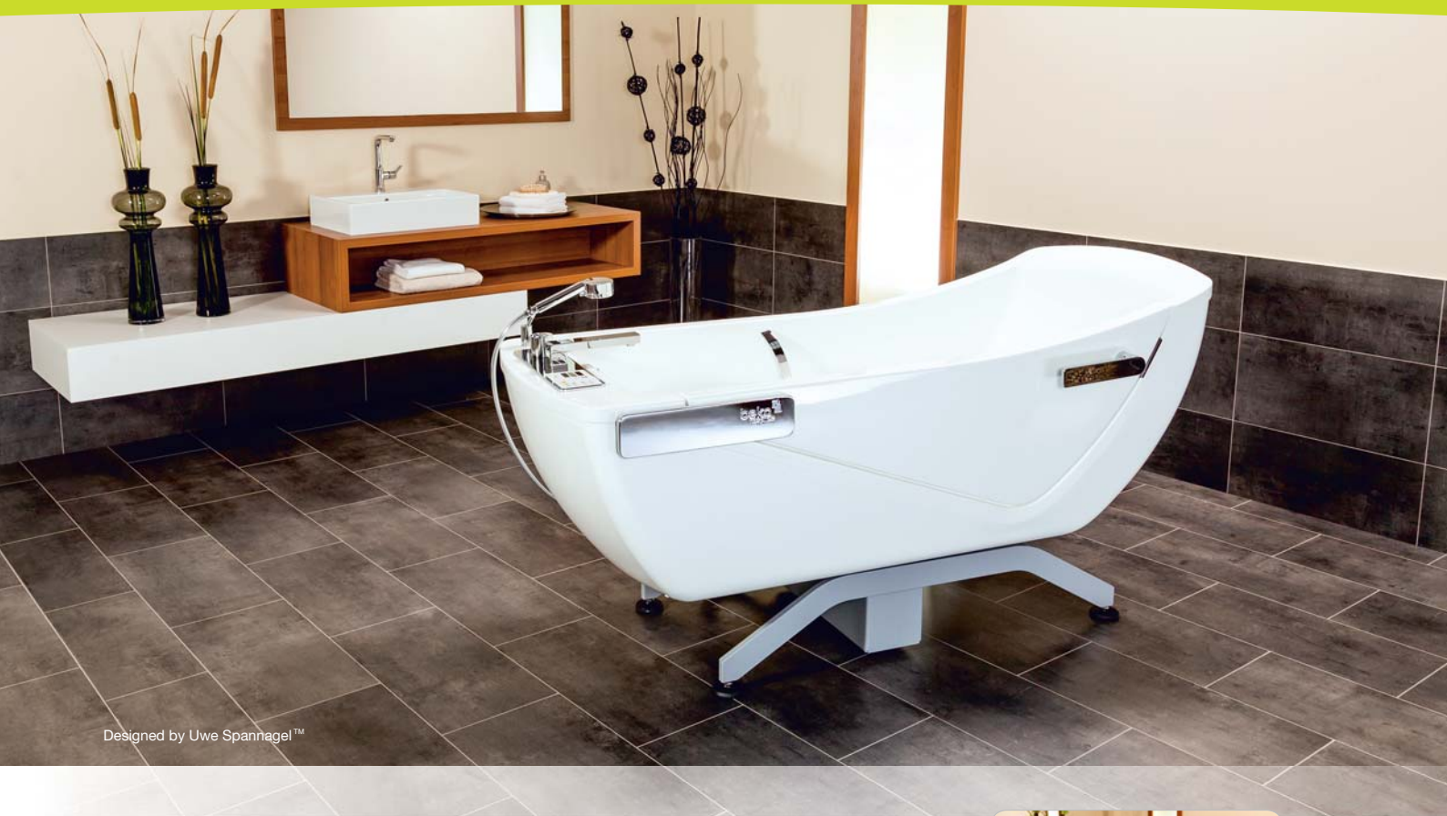
Designed by Uwe Spannagel™

The pure and soft contours of the tub remind at first sight of a modern, state-of-the-art private bath tub and integrate itself perfectly to the existing wellness- and bathing concept of the facility. The functions have been optimized in close cooperation with experts from the care and therapy sector and have been adapted to the experiences of the daily work. This provides a wonderful bathing experience for the patient as well as for the care staff with a maximum of safety and comfort.