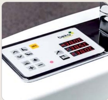
7 Operation keypad with all functions.