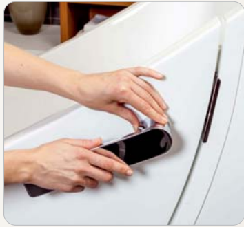
1 Door latch with safety locking for maximum safety.