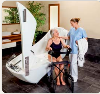
2 The extra large door opening facilitates the entry with mobile lifts as well as the self-entry.