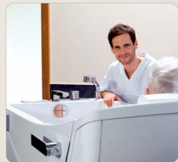
6 Free view into the room because of no-barrier console.