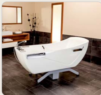
5 By the free under passing carrier frame, a transfer with an active lift as well as with a sling lift is possible.