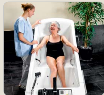
9 Sufficient space for the upper body, especially for larger persons.