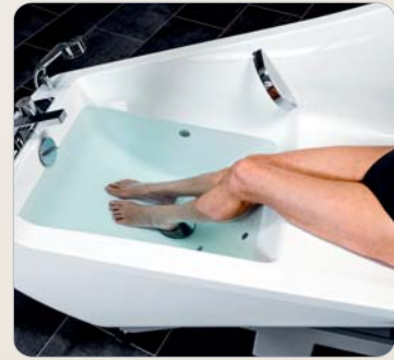
3 Generous foot zone with a pre-filling volume of 98 l and additionally chromed brass holding grips for safe hold during bathing.